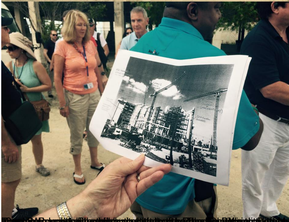
Photo of the building under construction. The photo was taken by the author, Richard Skillman, on the day of the construction. The photo is a black and white photograph. The building is a large, multi-story structure with a complex framework of columns and beams. The building is surrounded by lush green trees. The sky is blue with scattered white clouds.